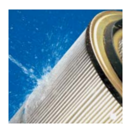
... nor does a "good thorough wash" do them any harm